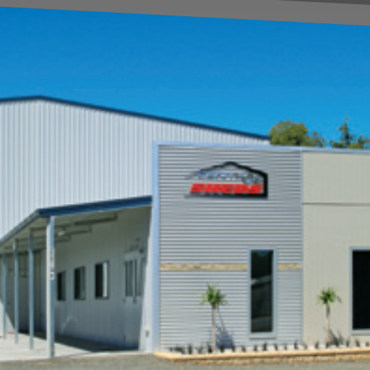
Central Vic Sheds is built on a solid foundation of quality and service

With over 40 years experience in the industry, Central Vic Sheds is a family business that has built a reputation for constructing solid steel buildings and providing dependable service.