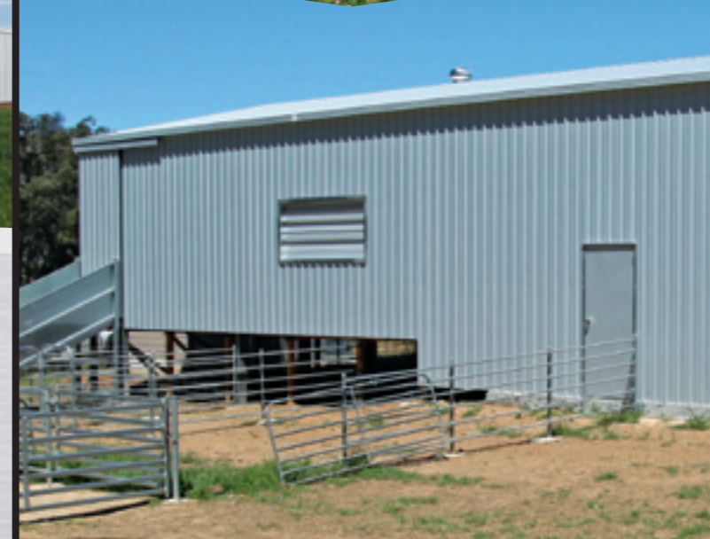
Shearing Shed 18m x 9m x 4.2m Heathcote

Central Vic Sheds offers a 100% satisfaction guarantee on all our sheds. This means we don't leave until you are completely happy with your finished shed. If you aren't happy, then we aren't happy!