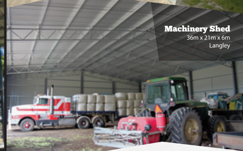
Machinery Shed 36m x 21m x 6m Langley