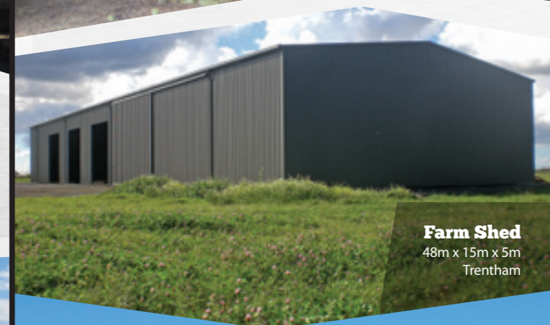
Farm Shed 48m x 15m x 5m Trentham

We use only heavy structural-grade Australian steel, and our fabrication carries a huge 5-year structural guarantee. With three frame types to choose from including UB/Gal web truss, RHS or Purlin frame, we top all of this off with more bolts per connection to finish your shed frame to solid Terrain CAT ratings at the top end of the scale. Size is no problem as our UB/Gal web truss design can span up to 60m.