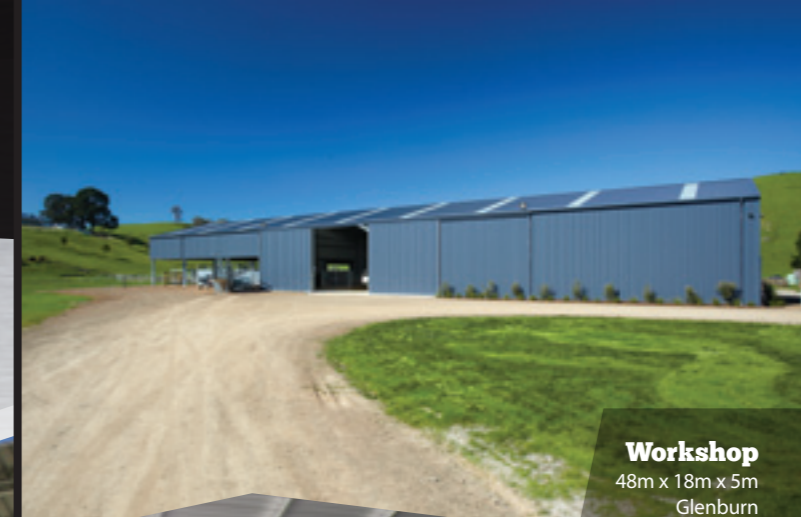
Workshop 48m x 18m x 5m Glenburn