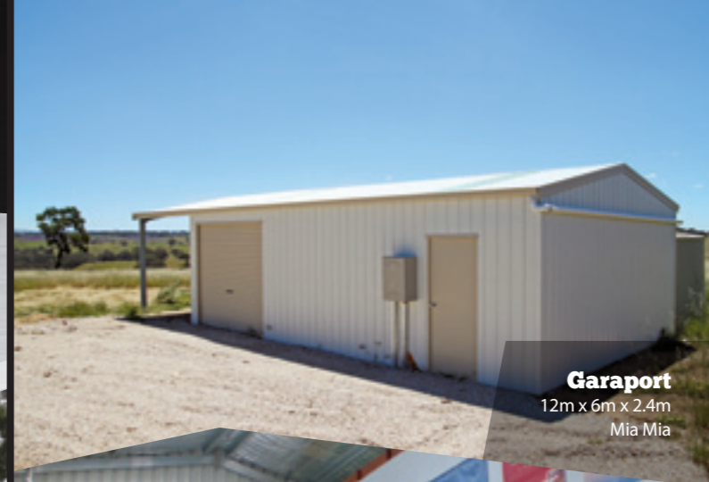
Garaport 12m x 6m x 2.4m Mia Mia