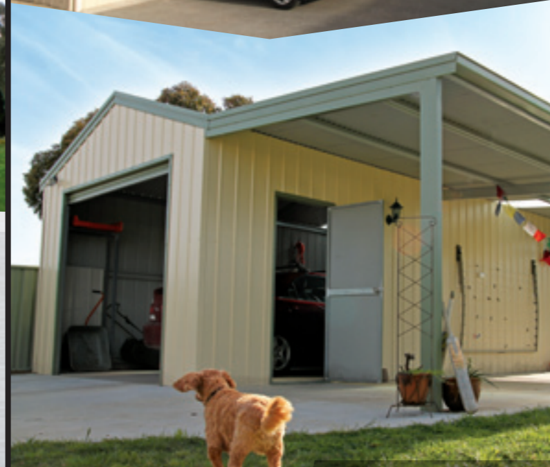
Garage with Lean-to 8m x 4m x 2.7m Kyneton

Central Vic Sheds offers a 100% satisfaction guarantee on all our carports, garages and sheds. This means we don't leave until you are completely happy with your finished shed. If you aren't happy, then we aren't happy!