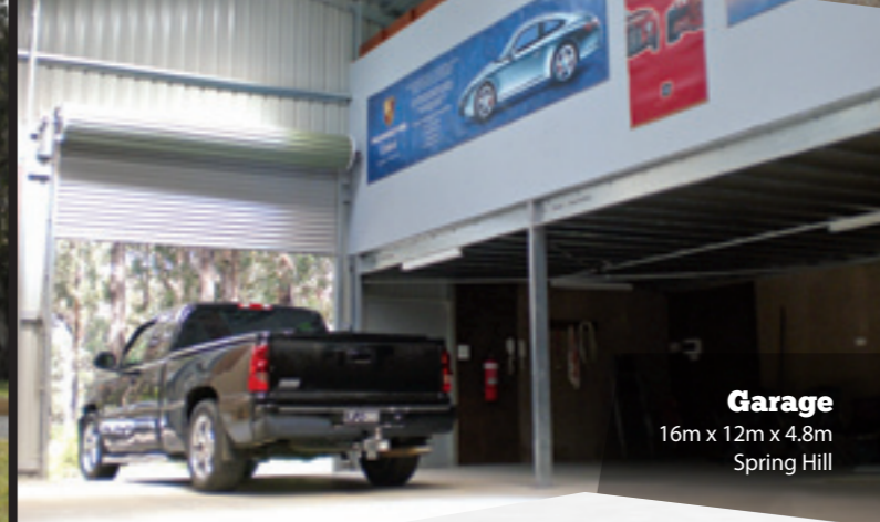
Garage 16m x 12m x 4.8m Spring Hill