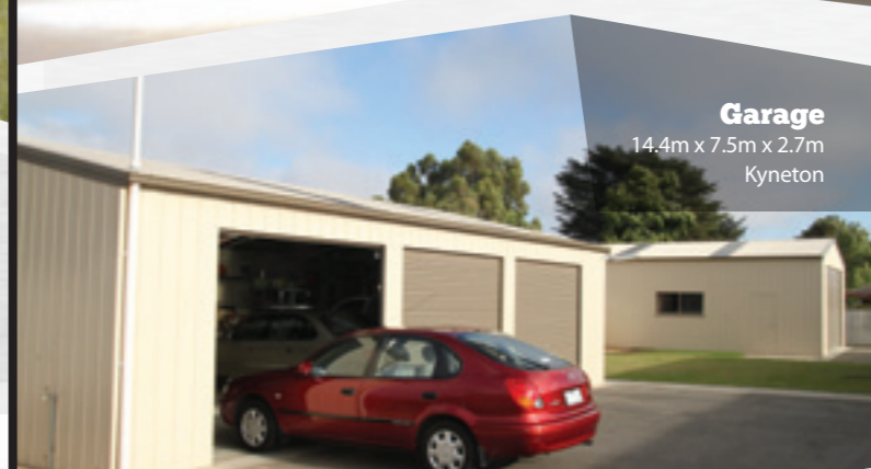
Garage 14.4m x 7.5m x 2.7m Kyneton