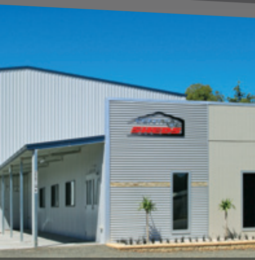
Central Vic Sheds is built on a solid foundation of quality and service

With over 40 years experience in the industry, Central Vic Sheds is a family business that has built a reputation for constructing solid steel buildings and providing dependable service.