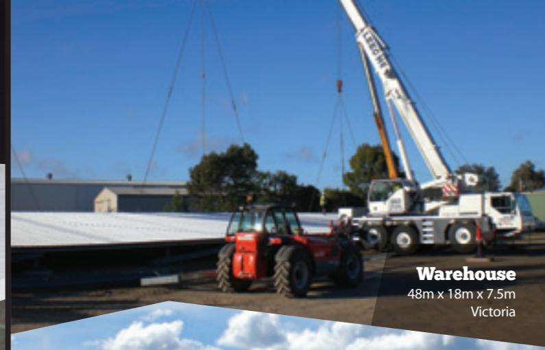
Warehouse 48m x 18m x 7.5m Victoria