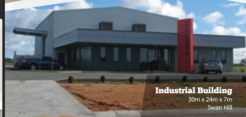
Industrial Building 30m x 24m x 7m Swan Hill

We use only heavy structural-grade Australian steel, and our fabrication carries a huge 5-year structural guarantee. With two frame types to choose from including UB/Gal web truss and RHS, we top all of this off with more bolts per connection to finish your building frame to solid Terrain CAT ratings at the top end of the scale. Size is no problem as our UB/Gal web truss design can span up to 60m.