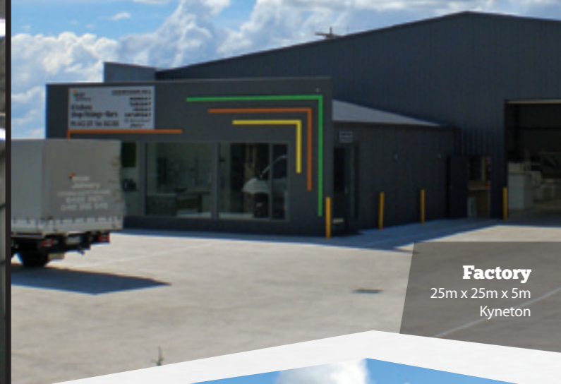
Factory 25m x 25m x 5m Kyneton