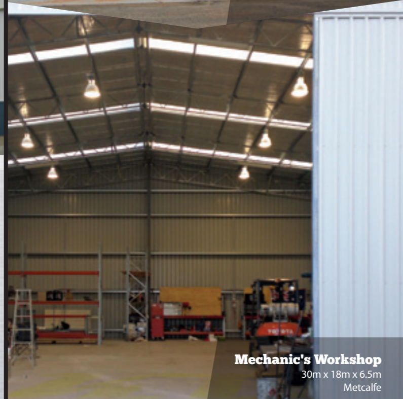
Mechanic's Workshop 30m x 18m x 6.5m Metcalfe

Central Vic Sheds offers a 100% satisfaction guarantee on all our industrial buildings. This means we don't leave until you are completely happy with your finished shed. If you aren't happy, then we aren't happy!